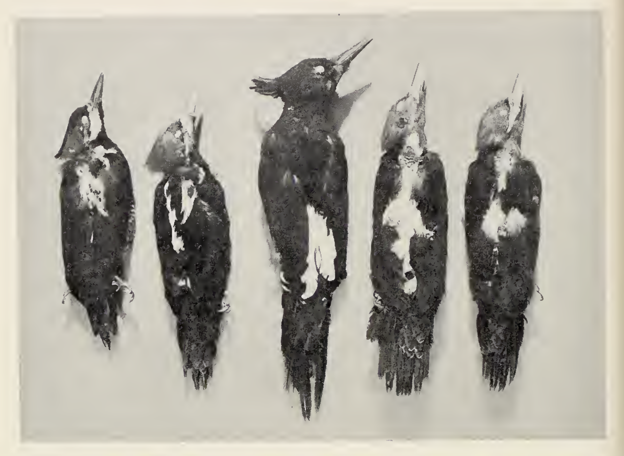
FIG. 9. From left to right are a female and a male of Campephilus melanoleucus , a female Magellanic Woodpecker, and a male and female of Campephilus robustus .

heads, including the crest, and females with a crest that is black anteriorly and red posteriorly. The black crest feathers of these females are usually more elongate than the red feathers (sometimes red feathers are longer, but, if so, they have black tips). These black crest feathers occasionally curl somewhat forward (specimens of P. leucopogon and P. melanoleucos). I suggest that differential wear of black and red feathers may have been a factor in the evolution of the crests of these species, for melanin-containing feathers appear to be more durable and resistant to wear than are red feathers. The evolution of the three large species of Campephilus has been marked by reduction or elimination of red in the female's crest and head pattern. In the northern ivory-bills the females have entirely lost their red coloration of the head, and their long crests are black. The males of these two species have a reduced amount of red in the crest; essentially they have assumed the female head pattern of Phloeoceastes melanoleucos and P. guatemalensis. However, males of the northern ivory-bills have the red feathers of the crest longer than the black ones. The head pattern of the Magellanic Woodpecker has developed differently. The female of this species has a reduced amount of red, which occurs around the bill (the only other campephiline species the